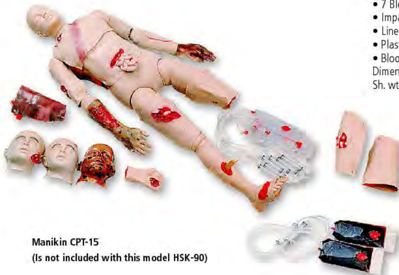
Manikin CPT-15 (Is not included with this model HSK-90)