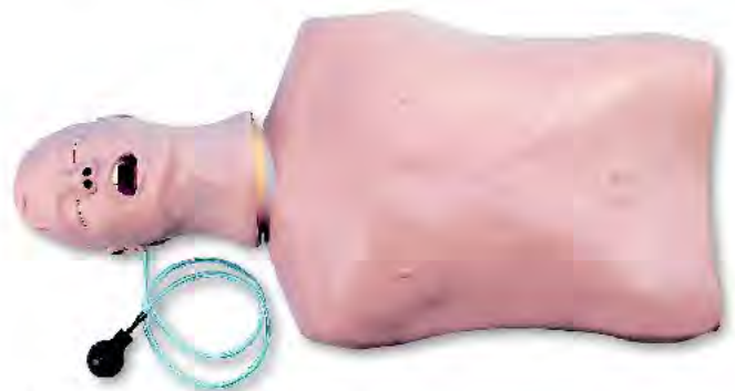
ERI-20 "Airway Larry" Airway Management Trainer Manikin.

For Airway Management procedures. Anatomical landmarks include the sternum, rib cage, and substernal notch. The trainer also contains teeth, uvula, vocal cords, glottis, epiglottis, larynx, arytenoid cartilage, trachea, esophagus, and inflatable lungs and stomach. Allows nasogastric tube placement. Accepts Combitube, E.O.A., E.G.T.A., and P.T.L. airways. Bag-valve mask ventilation. Comes with soft carrying bag. Dimensions: 69 x 43 x 25 cm. Sh. wt. 9.98 kgs.