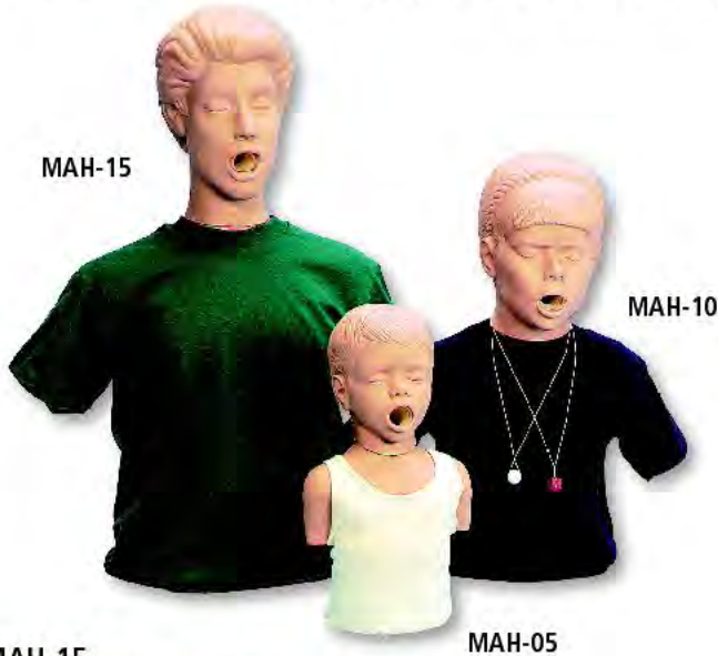
MAH-15 Adult Choking Manikin with Carry Bag.

Dimensions: 66 x 21 x 21 cm. Sh. Wt. 3,20 Kgs.