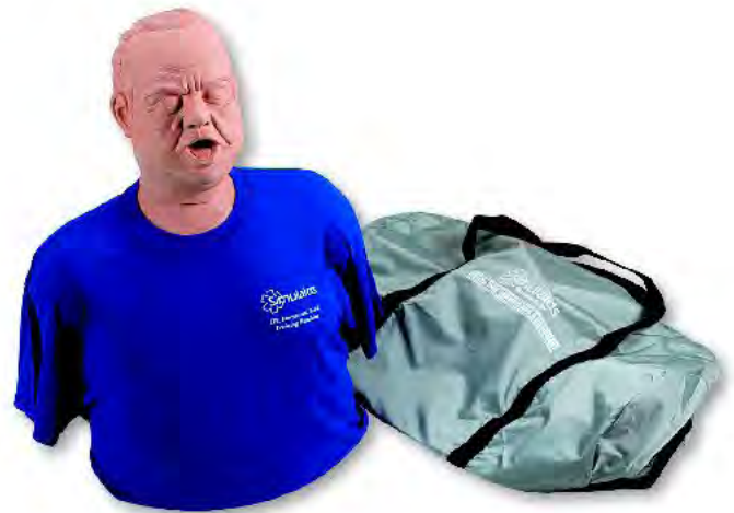
MAH-20 Obese Adult Choking Manikin with Carry Bag.

Dimensions: 43 x 25 x 18 cm. Sh. wt. 2.26 kgs.