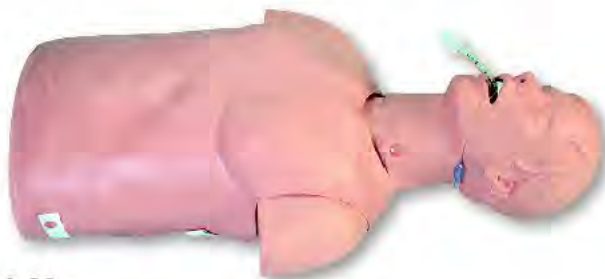
TIA-20 Adult Airway Management Trainer.

Dimensions: 76 x 53 x 33 cm. Sh. wt. 10.43 kgs.