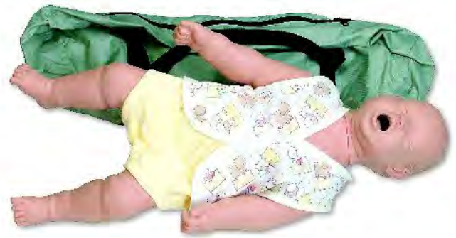
MAH-00 Infant choking manikin with carry bag.

Choking emergencies are not selective when it comes to age groups, so we offer three generations of choker training models to choose from, including the latest addition, the Infant Choking Manikin. These lightweight manikins all function on the same principle - clearing a blocked airway. Each manikin comes with two objects that will lodge in the oral pharyngeal space, representing any object stuck in the air passages of a victim. Once the object is lodged, the student must use the anatomical landmarks to decide where to place their hands and how much pressure is required to accomplish the maneuver. Whether it is a 9-month-old baby, child, adolescent, adult, or oversized adult, these trainers give you immediate visual feedback when the procedures are done correctly. Manikins include rib cage, xiphoid process, and suprasternal notch to provide anatomical reference. Each manikin comes with two choking objects, shirt, and soft carry bag.