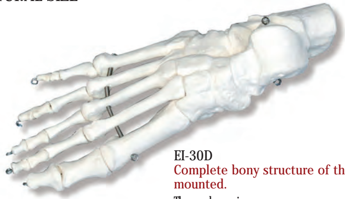
EI-30D Complete bony structure of the foot, mounted.

It is supplied unmounted, the bones are loose. Dimensions: 25 x 10 x 6 cm. Sh. wt. 0.19 Kgs.