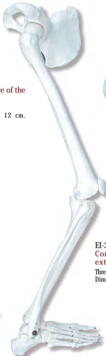
EI-36D Complete bony structure of the lower extremity. It reproduces half pelvis.

Threaded on wire. Dimensions: 100 x 25 x 12 cm. Sh. wt. 0.60 Kgs.