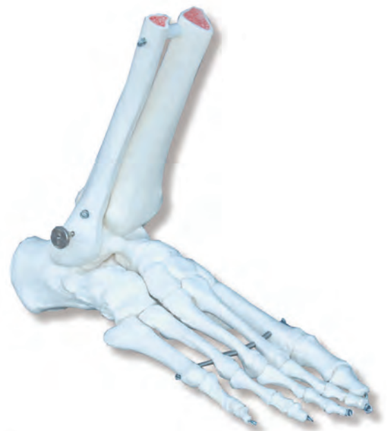
EI-31D Complete bony structure of the foot with tibia and fibula section.

Threaded on wire. Dimensions: 100 x 25 x 12 cm. Sh. wt. 0.90 Kgs.