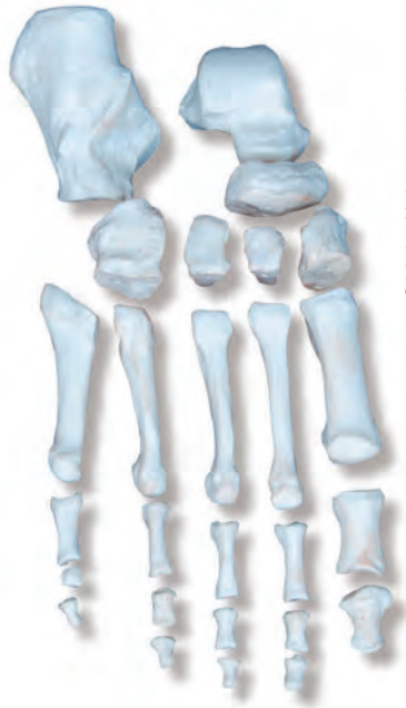
EI-28D Complete bony structure of the foot.

It is supplied unmounted, the bones are loose. Dimensions: 25 x 10 x 6 cm. Sh. wt. 0.19 Kgs.